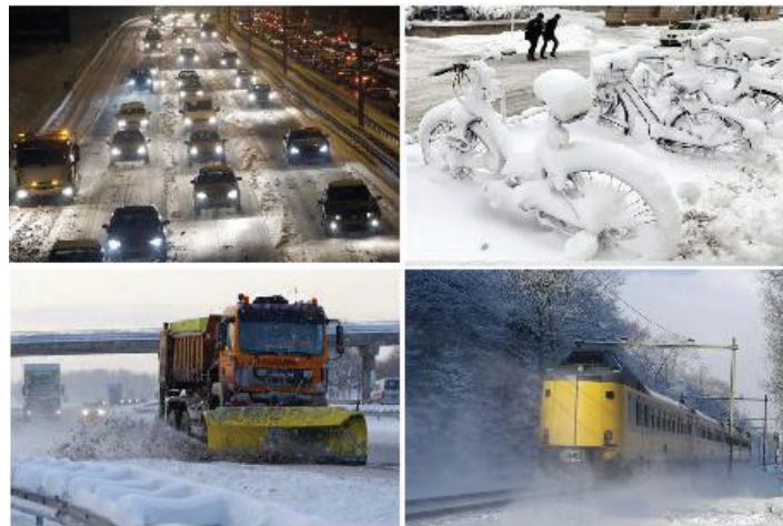
Winter weather in The Netherlands